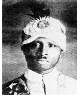
(Noble Drew Ali)

A man named Timothy Drew founded the Moorish Science Temple (MST) in 1913. He was born in North Carolina on January 8, 1886. He converted to Islam after a visit to Saudi Arabia. Marcus Garvey and his group heavily influenced Drew, and after Garvey was deported in 1927 many of his followers joined Drew's organization. He took the name Noble Drew Ali and proclaimed himself as a prophet of Allah (God). He was a member of the Ancient Egyptian Nobles of the Mystic Shrine, or commonly called the "Black Shriners". The men in this MST wore fezzes as part of their dress. They were also required to wear colored shorts with elastic just below the knee and uniforms or robes of purple or red, which resembled those worn by the Shriners. They were considered to be Asiatic or Moors instead