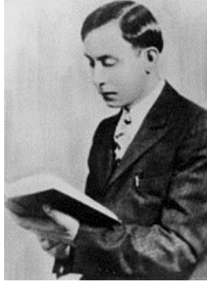
(Wallace D. Fard)

The Nation of Islam was started after the death of Noble Drew Ali and the exile of Marcus Garvey. There was a need to fill the void in the Black Nationalist movement. The founder of the order was named Wallace D. Fard. Many authors have claimed that he was a member of the Moorish Science Temple of America, and in some of the records of the MST the name W.D. Fard is found, but in the book History of the Nation of Islam by Elijah Muhammad, he states that Fard “was no follower of Noble Drew Ali.” 2 Nevertheless, the similarities of the two groups including their theology cannot be disputed. Since many of the new members of the NOI were from the other two groups, there can be no doubt of their influence of the order. It is also stated that Fard was influenced by the Jehovah’s Witnesses. He